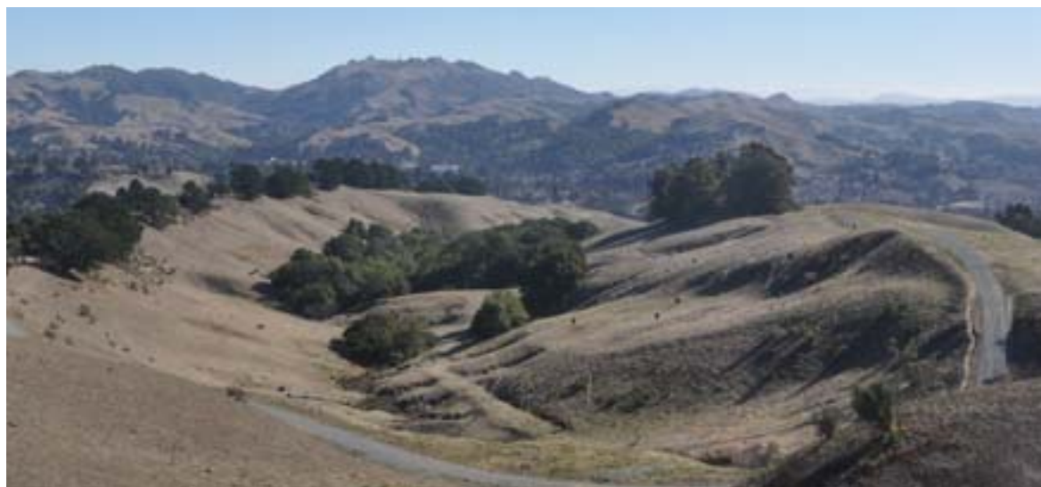
Mulholland Ridge Open Space Preserve